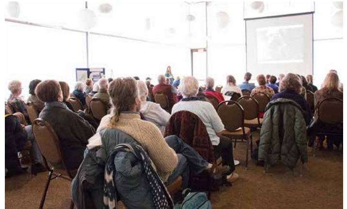
We learned that southern Wisconsin has many interesting and beautiful types of butterflies.